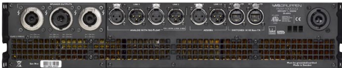
PLM 10000Q Neutrik Speakon connector version shown.

The PLM Series Powered Loudspeaker Management systems are equipped as standard with Dante, a self-configuring digital audio networking solution from Audinate® of Australia. Based on the newest developments in networking technology, Dante provides reliable, sample-accurate audio distribution over Ethernet with extremely low latency. Dante incorporates Zen™, an automatic device discovery and system configuration protocol which enables PLM Series products and other products with Dante (like Dolby Lake Processors) to find each other on the network and configure themselves.